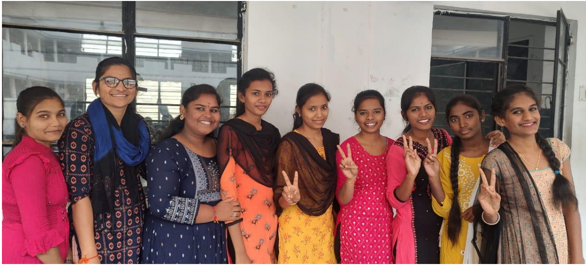
JAM COAHING CAMP 2023