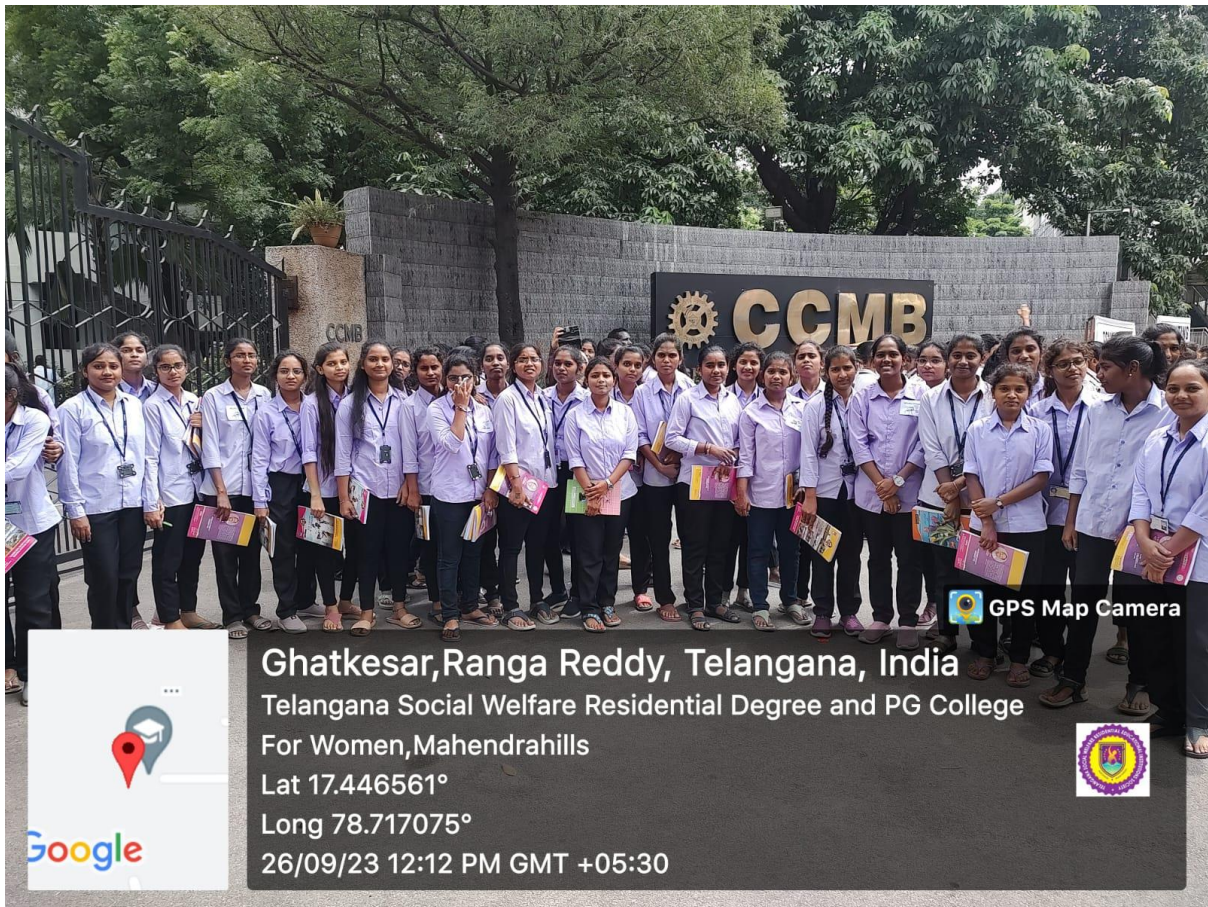
Students visited CCMB for OPENDAY program @ CCMB