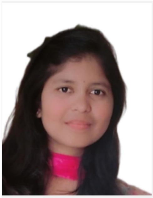
P NAVYA MBZCIII Secure Seat in IIT SHIBPUR