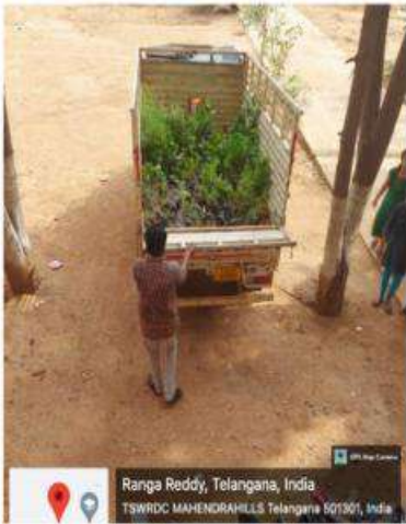
Ranga Reddy, Telangana, India TSWRDC MAHENDRAHILLS Telangana 501301, India