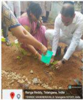
Ranga Reddy, Telangana, India