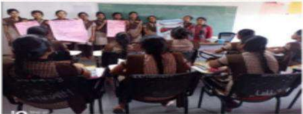
Team with principal madam, students explaining about life cycle of Plasmodium