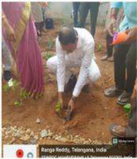
Ranga Reddy, Telangana, India