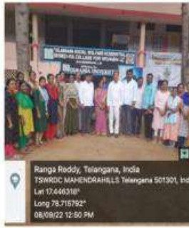
Ranga Reddy, Telangana, India TSWRDC MAHENDRAHILLS, Telangana 501301, India Lat 17.666318° Long 78.715792° 08/09/22 12:50 PM